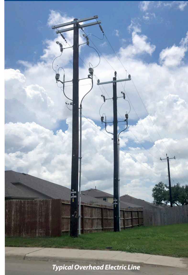
Typical Overhead Electric Line